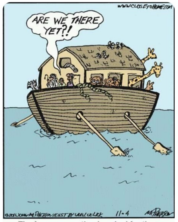
The famous question is asked for the first time.

This is not a Coronavirus helpline – for any questions regarding COVID-19 please go to NHS 111. However, you may find the counselling helpline useful in other circumstances. It can be used for yourself, by family residing at the same address and for clergy. It is provided through our Catholic Insurance Service; it is the Cigna Scheme for the Dioceses of England. The Scheme number is 70258. Phone: 0330 0580960, press option 5 for the Counselling Service. It is completely confidential.